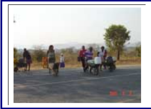
Women from the village carrying water jugs to the nearest standpipe more than 2 km away.