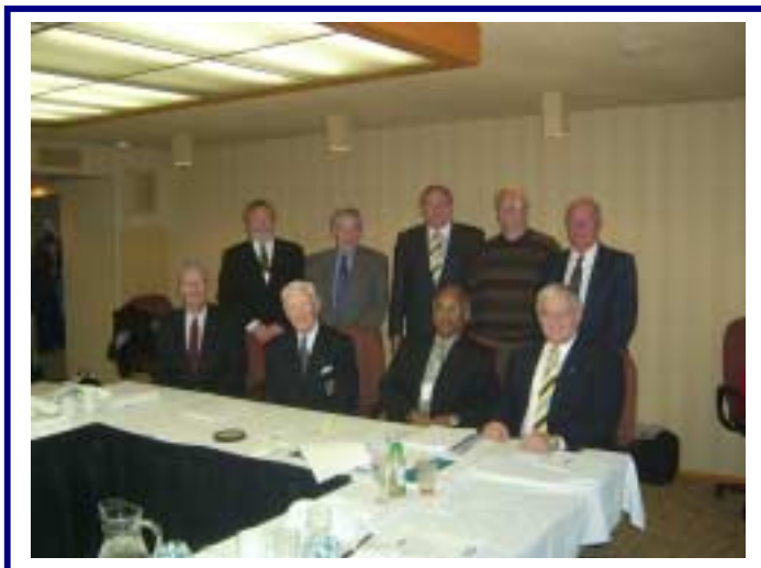
Members of CRCID and TRF Canada