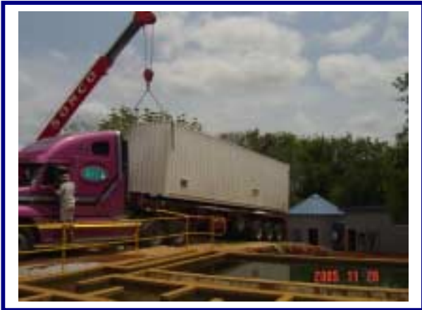
The Zenon water plant arriving in a sea container and being installed at the Letsitele site.