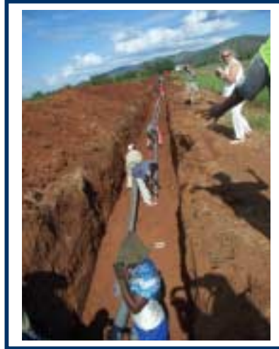
Workers hired from the local villages to help lay the pipe.