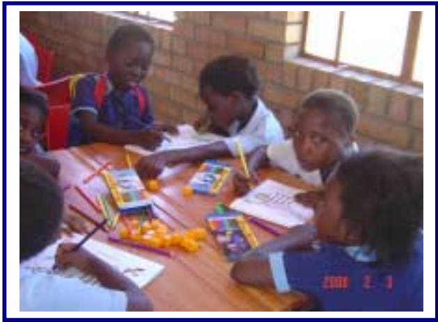
Grade 2 children in one of the village schools colouring in a booklet that is part of the educational awareness program on water conservation.